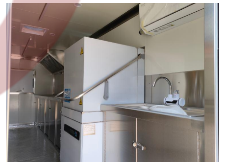
- Appliances -