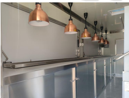
- Interior -