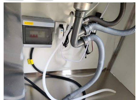
- Plumbing -