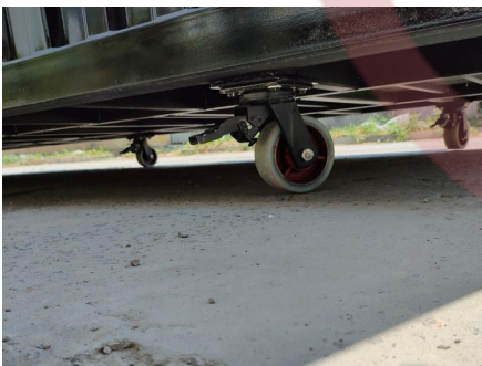
- Casters -