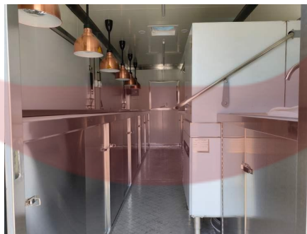
- Interior -