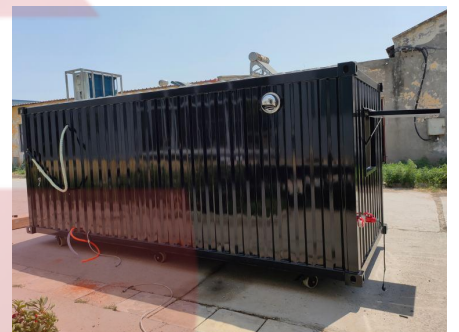
- Rear -